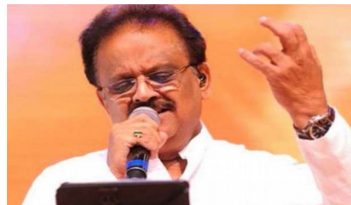
Song Quiz – A tribute to SP Balasubramaniam